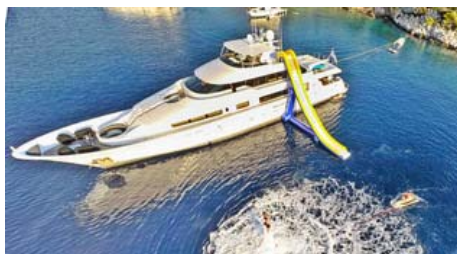
50 feet slide!