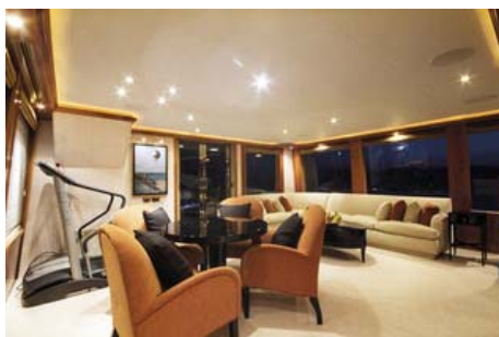
upper deck lounge 1