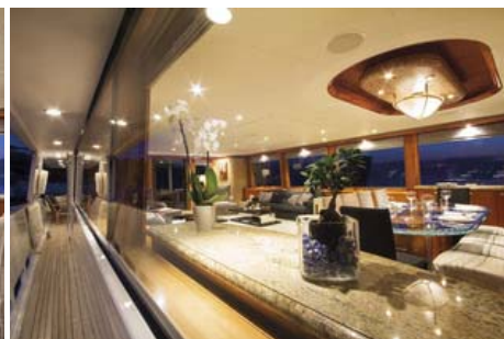
360 window views