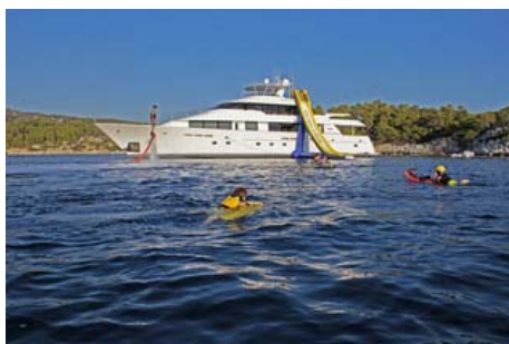
slide + toys