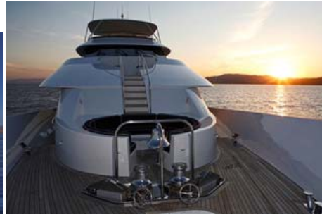
forward other view