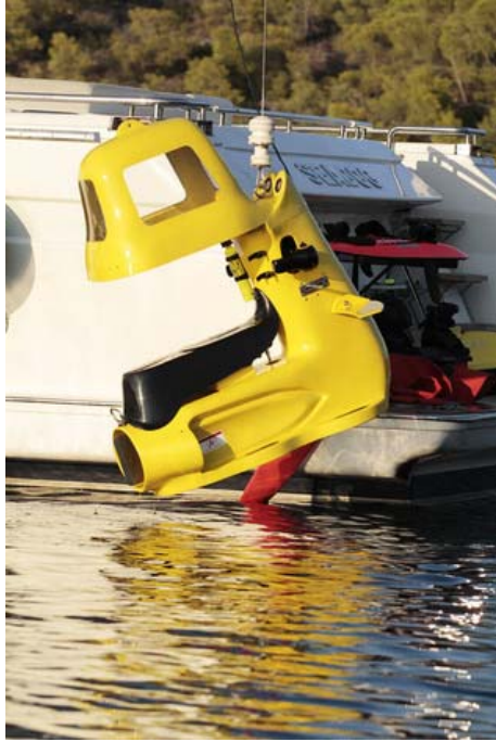
submarine ( upon request )

This document is not contractual. All specifications are given in good faith and offered for informational purposes only. The publisher and company do not warrant or assume any legal liability or responsibility for the accuracy, completeness, or usefulness of any information and/or images displayed. Yacht inventory, specifications and charter prices are subject to change without prior notice. None of the text and/or images used in this brochure may be reproduced without written consent from the publisher.