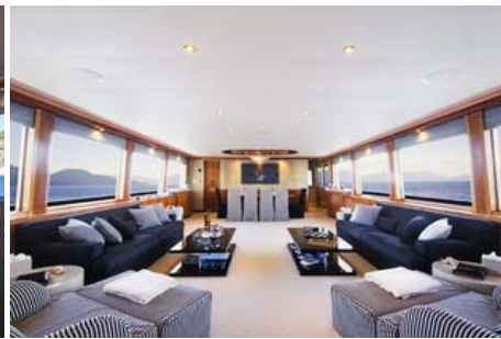
main saloon area 2