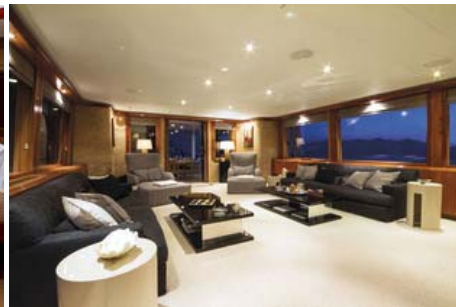
main saloon area 5