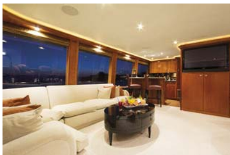
upper deck area