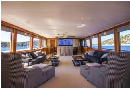
main saloon area 4