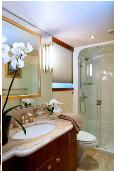
twin cabin 2