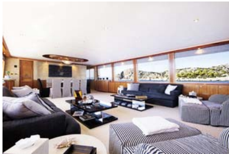
main saloon area 1