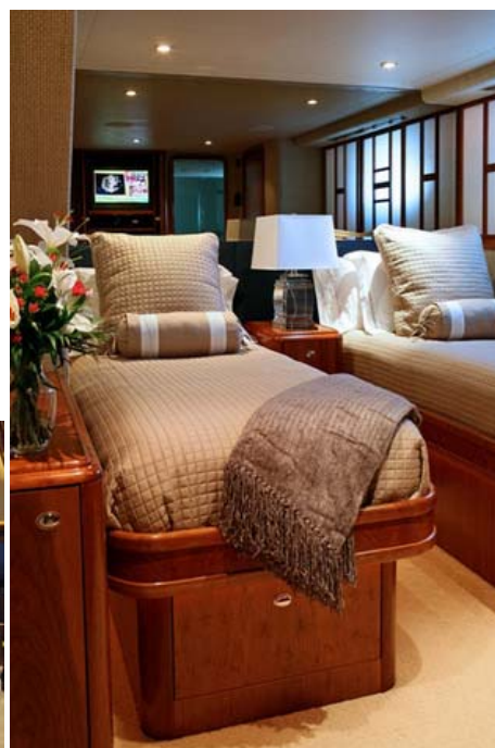
twin cabin 1