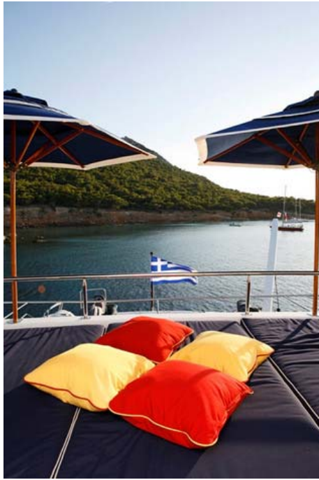
upper deck 1