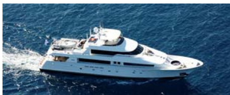
endless summer cruising

Tenders + toys: Tender: Nautica 4,5m - Yamaha engine 125hp Water sports: 2 x Yamaha 1200cc wave runners (3 person), Canoes, Water Skis, wakeboard, kneeboard, scuba diving, tubes, fishing gear Special Features: WATER SLIDE