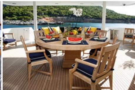
main deck 1