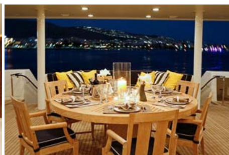
main deck 3