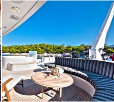
upper deck lounge