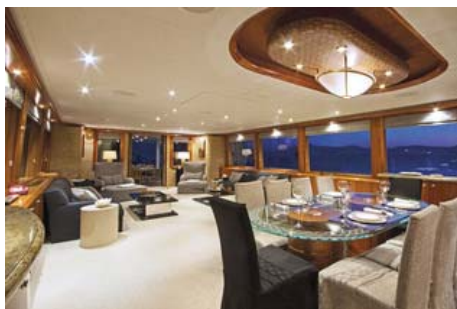
main saloon area 3