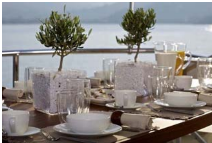
Aft dining details