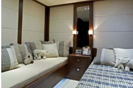
Guest Cabin b