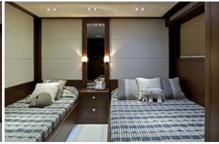
Guest Cabin a