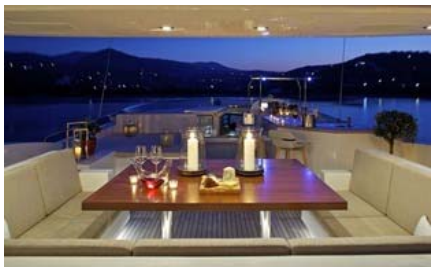
dine at fly