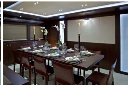
dining closer view