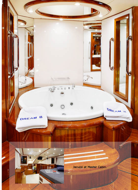
Jacuzzi at Master Cabin.