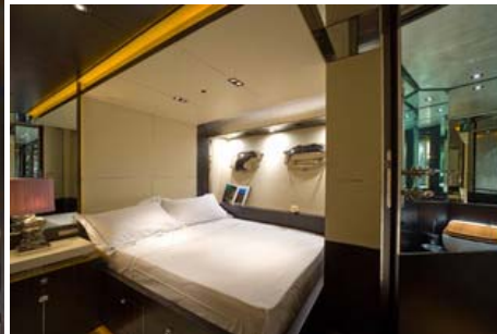
double suite other view