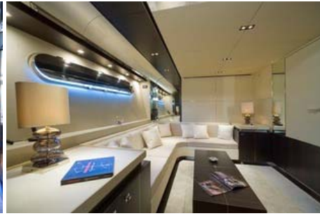
Saloon of master a