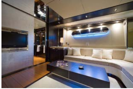
Saloon of master b