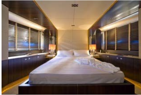
Vip other view