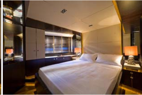
suite other view