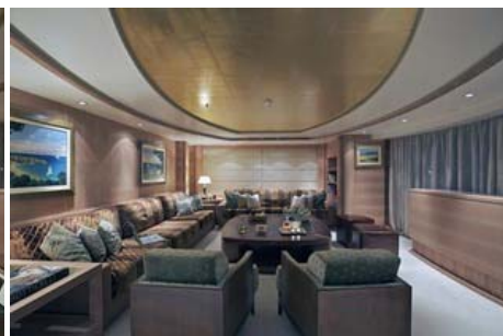
UPPER LOUNGE 3