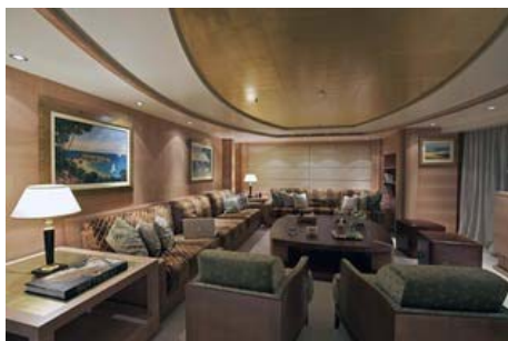
UPPER LOUNGE 2