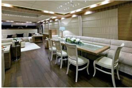
Dining and Salon2