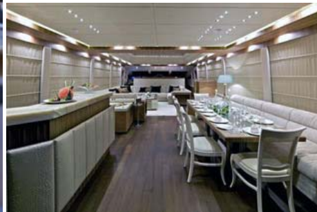
Dining and Salon