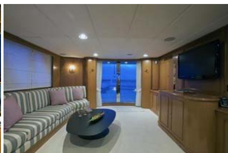
Sky Lounge 1