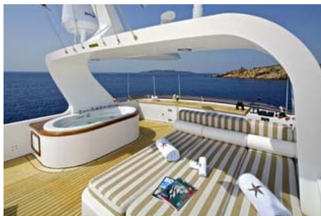
Sun Deck 4