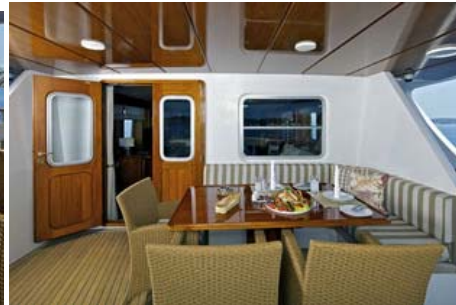
Aft Deck 3