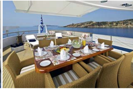
Upper Deck 3