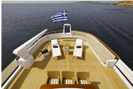
Upper Deck 2