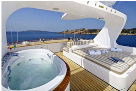
Sun Deck 2