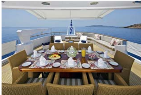
Upper Deck 4