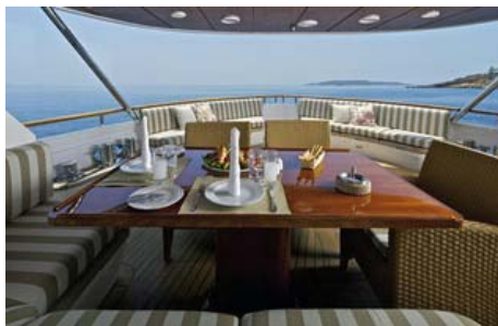
Aft Deck 2