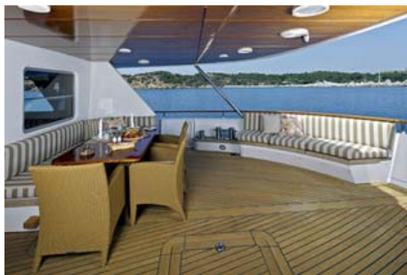
Aft Deck 4