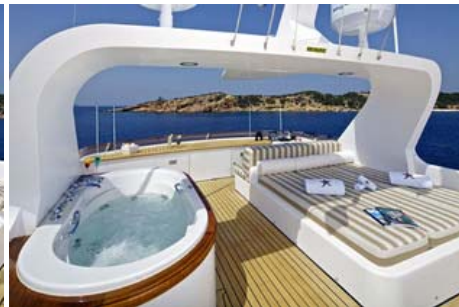
Sun Deck 3