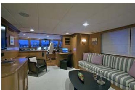
Sky Lounge 2