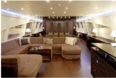
saloon view b