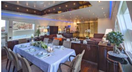
dining with huge open spaced windows