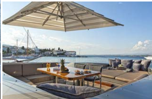
breakfast al fresco