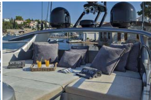
extra sundeck space