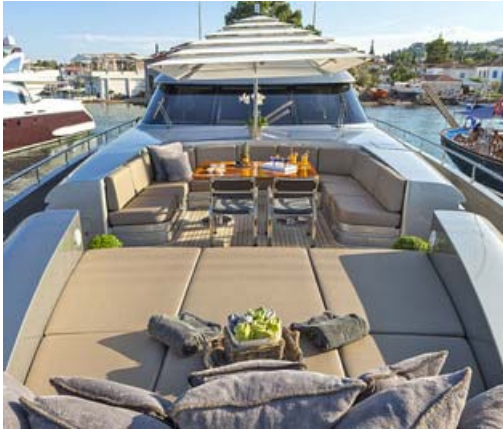
bow private space a