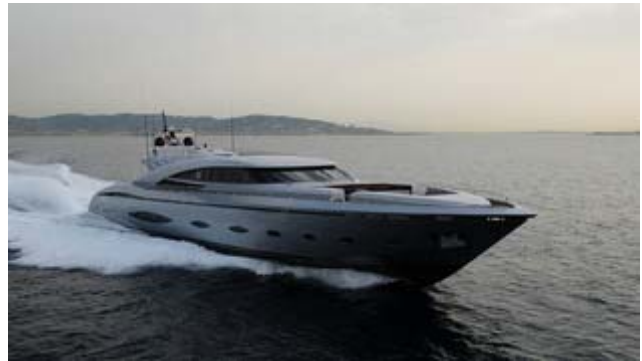
My Toy cruising b