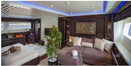
master presidential a