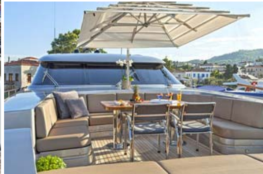
bow private space b