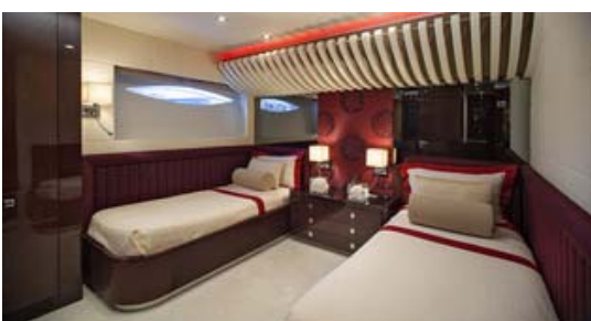
twin with semi double a