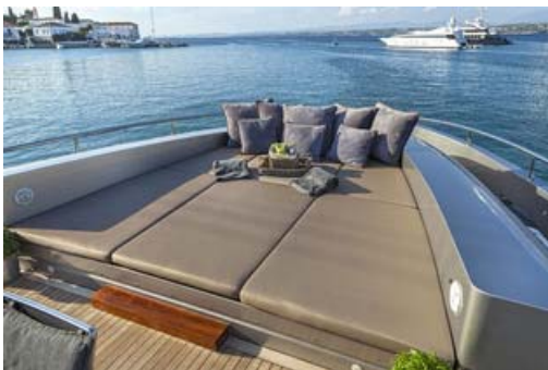
extra bow sun area