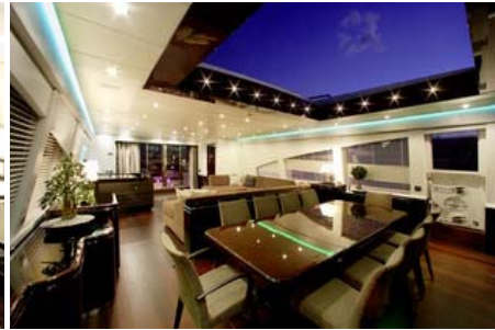
saloon with open roof