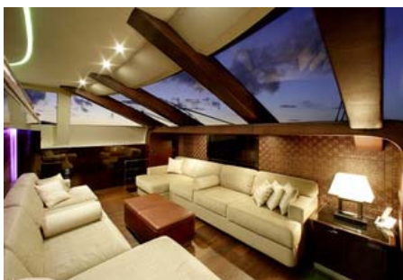
bow private playroom