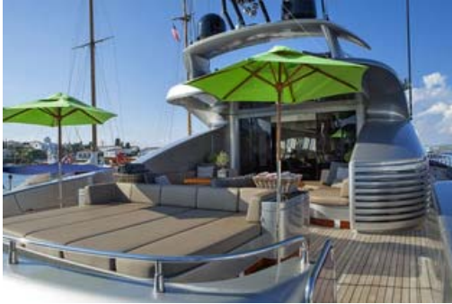
stern vast space