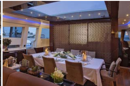
dining with open roof