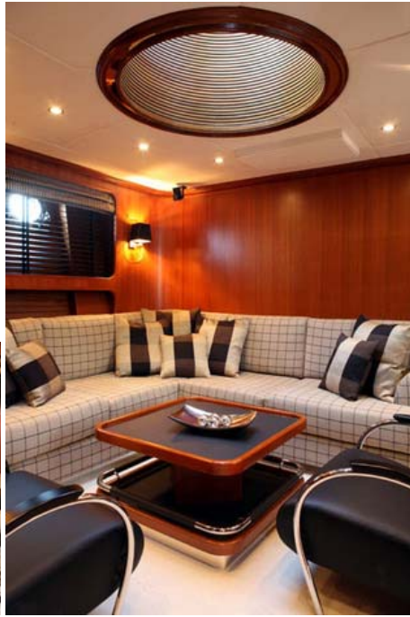
Gitana Salon 2