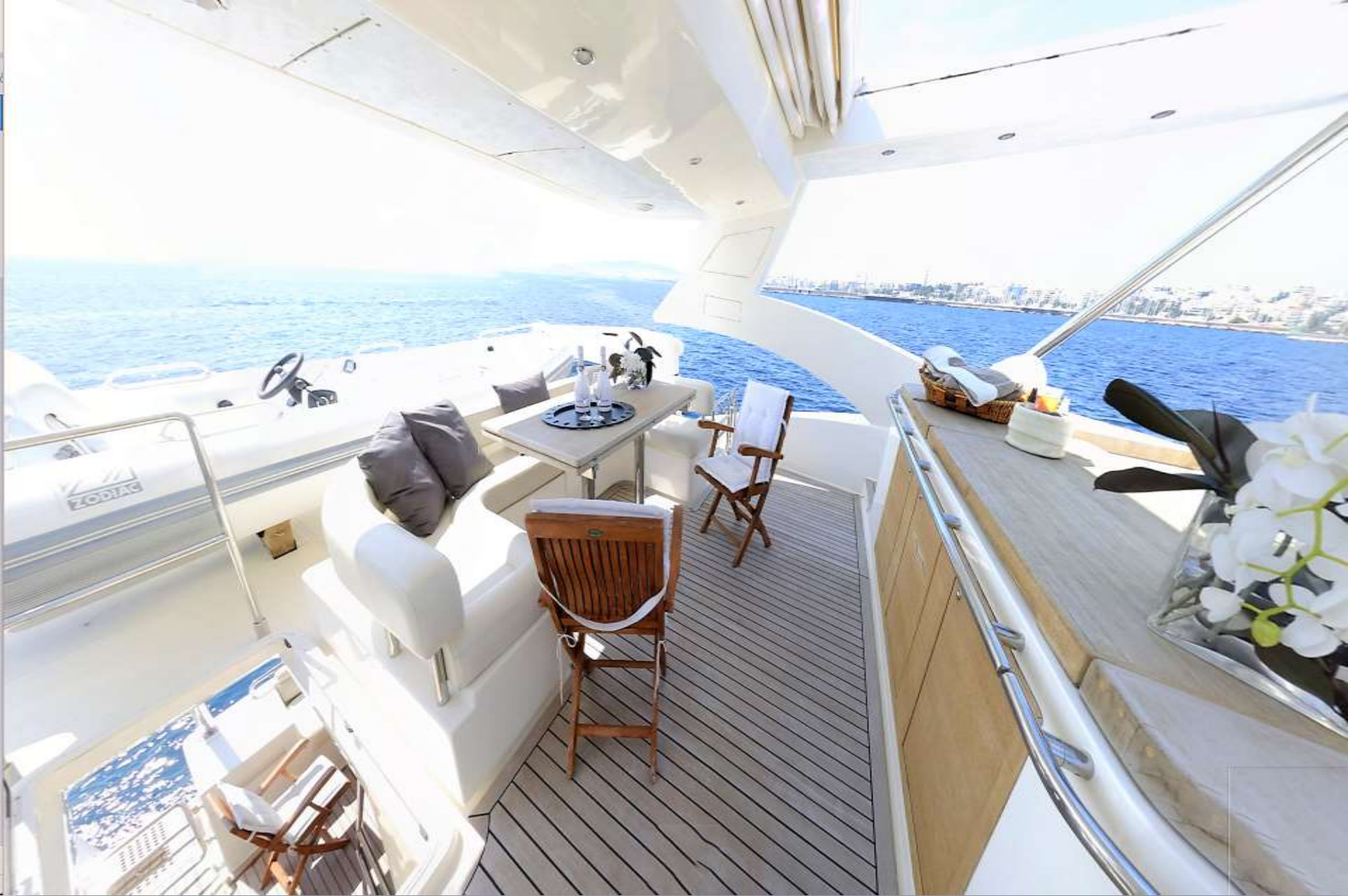
The very spacious fly bridge features a comfortable seating and dining area with a large foldable teak dining table