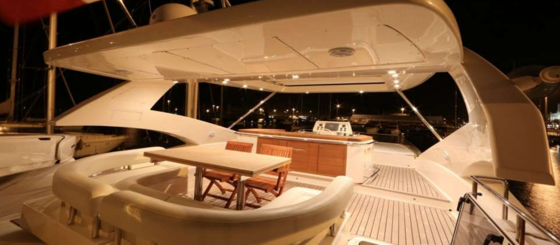
... of the sunset during the evening ...