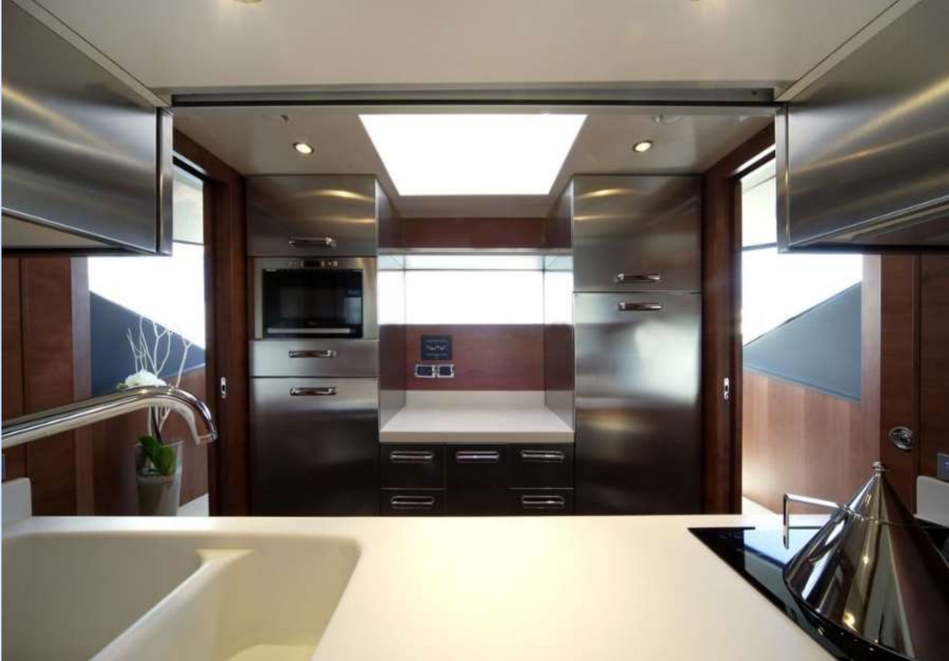
the exceptionally large separated galley is the chef's paradise and is located between the salon and the bridge