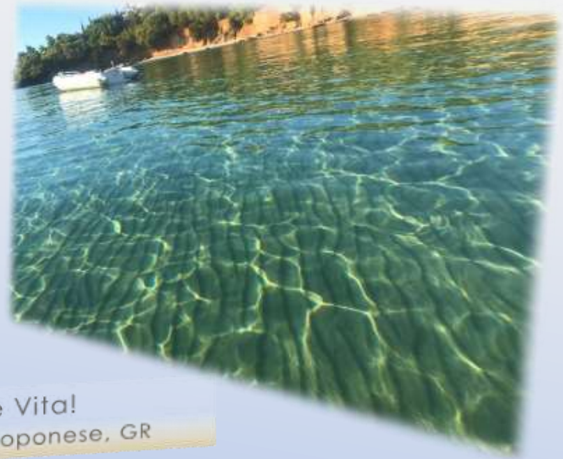
Questa è Vita! in Porto Heli, Peloponese, GR